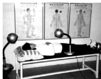
(Clinical application & add-on roller stand)